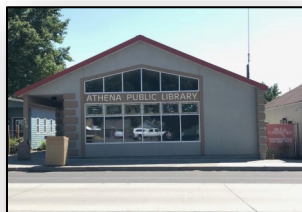
The "new" library

together to build a beautiful new library. Our new building has some of the only public meeting space in town, it has a cozy reading room with soft chairs in front of a welcoming fireplace. And, unlike the old building, it has dedicated spaces for children and young adults. Athena is understandably proud of the new library building. In fact, even though it's been nearly a decade and a half since the building was completed, when someone new comes to town you're likely to hear people asking them if they've "seen the new library."