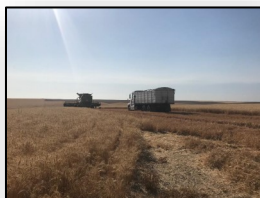
The view in Athena

A thena is a town of 1,300 people nestled in the wheat fields near the Blue Mountains by the Washington border. There has been a public library in Athena for